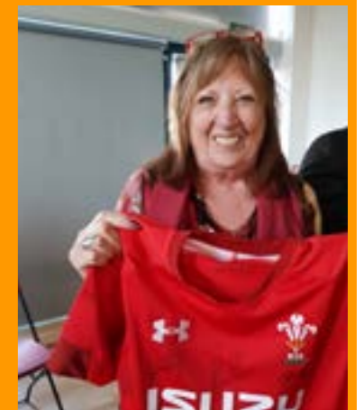
Welsh Rugby team!