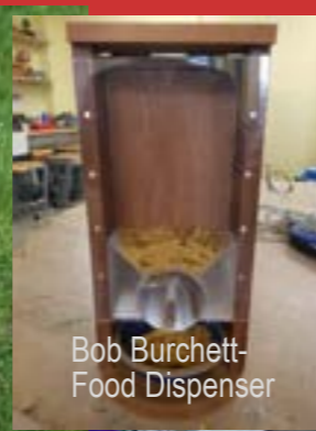
Bob Burchett- Food Dispenser