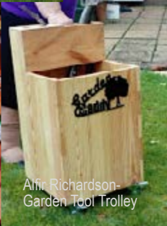
Alfie Richardson- Garden Tool Trolley