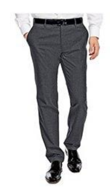
Girls Trousers Black Slim Fit trousers – Straight leg trousers also available.